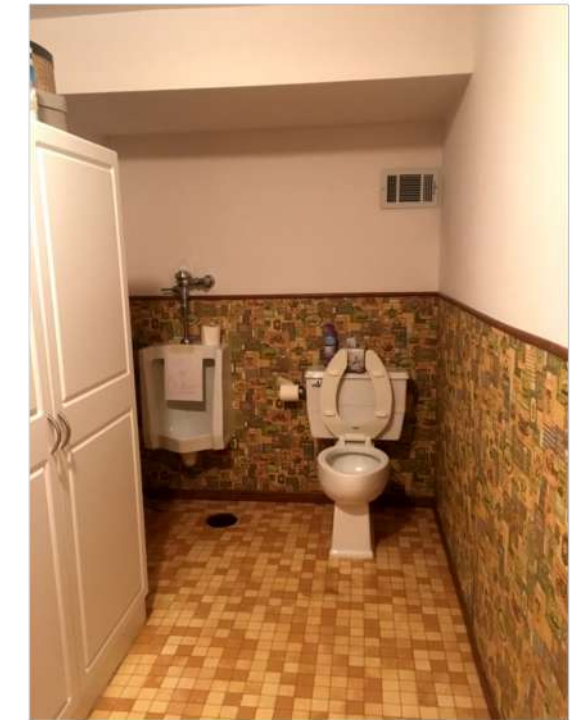
Outdated and unsanitary restroom surfaces were replaced with sanitizable tile and accessibility features were added.