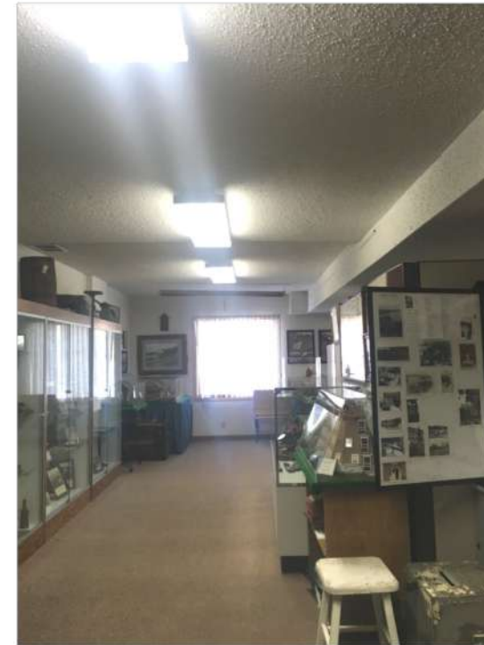
The basement carpet was replaced with an epoxy floor covering for better hygiene and durability. Walls were refreshed with new paint, and fluorescent lighting was replaced with LED for better collection care.