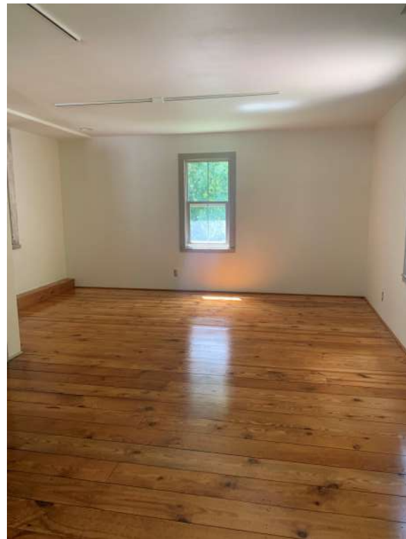
Classroom addition following rehabilitation.