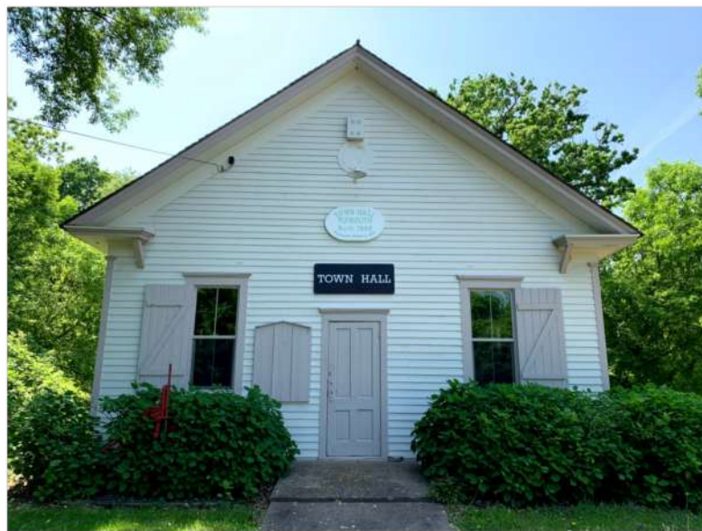
Plymouth's original town hall, now home of the Plymouth History Museum.

In recent months, the Plymouth History Museum has been undergoing an interior rehabilitation. The goal of this project was to address deferred maintenance issues within the museum and create a fresh and inviting space for staff, volunteers, and visitors.