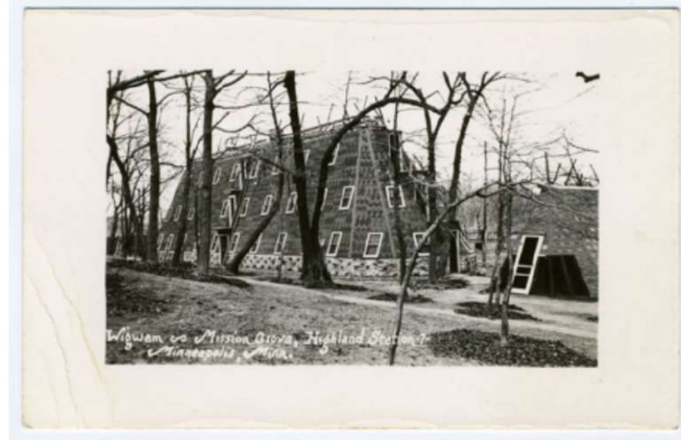
Postcard of the Wigwam.

The Mission Farms once held over seventy buildings on its property. Many were constructed from recycled brick from downtown Minneapolis buildings and mixed with natural fieldstone gathered locally. Most spectacular among these was the Wigwam—a three-story, stone, brick, and shingle-sided structure—an appropriation of a traditional Ojibwe architectural form. Its tapered sides, sloped windows, and rounded ends made it look more like a close cousin of the Merrimack, the Civil War ironclad warship. The Wigwam was just a stone's throw north of the Bath House Pavilion. If standing today, it would likely retain a national historic designation.