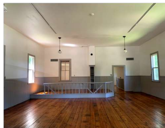
Main floor interior following rehabilitation.

bustling mills in Northeast Minneapolis. This humble structure served as the center of city government through the mid-twentieth century. Though used regularly for city meetings, throughout its history it would serve other needs of the town, including as a food pantry during the Great Depression and even as a setting for boxing matches. By 1961, the 1885 building ceased to be used for government meeting purposes, with its eventual functional replacement by the new Plymouth City Center (1978-1979), leaving the building redundant for over a decade.