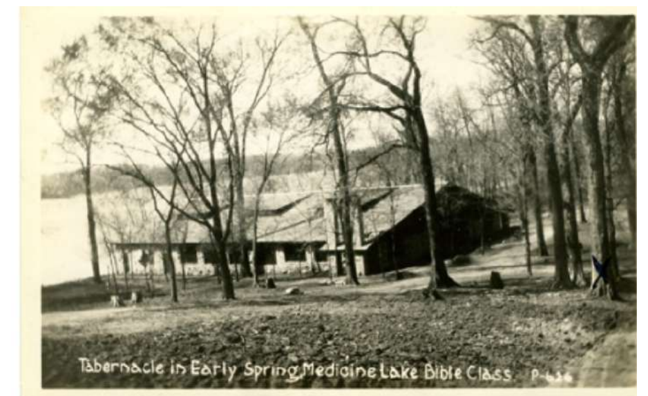
Postcard of the Tabernacle.

Do you or a relative have a story about attending church camp at the Mission Farms? We would love to hear from you!