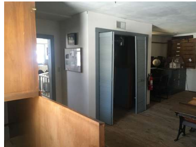
Previous to rehabilitation, the upstairs classroom addition was housing numerous items both on display and as storage. Additionally, it was serving as the PHS office space. The project included adding in new lighting options, repairing drywall, refreshing wall and floor surfaces, and installation of a new stair rail. Removal of the case above the stairs also revealed a section of original, historic 1885 timber siding.