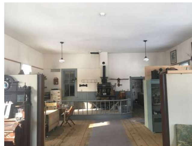
Museum main floor interior, previous to rehabilitation.