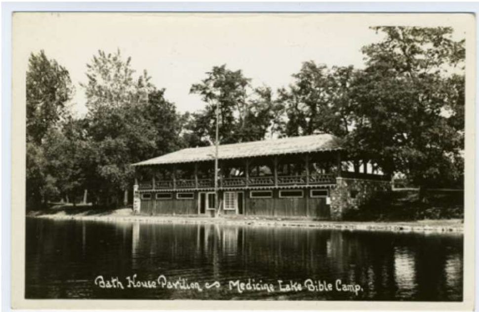
Postcard of the Bath House Pavilion.

If you've traveled to Lake Harriet, Bde Maka Ska, Lake Como, Minnetonka, or White Bear Lake, chances are you have either visited or seen photos of many postcard-pictured lakeside pavilions. Absent from the record for a long time was one at Medicine Lake. This postcard shows the Mission