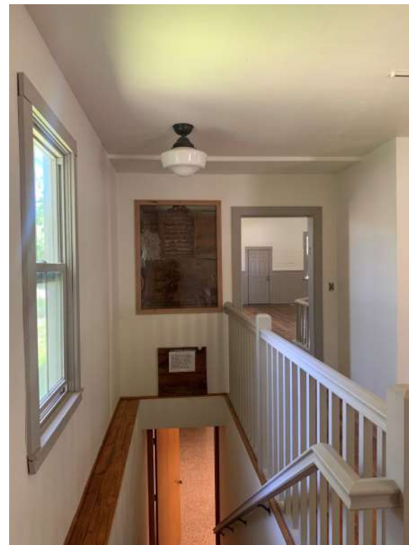
New hand rail over staircase with revealed historic siding above.