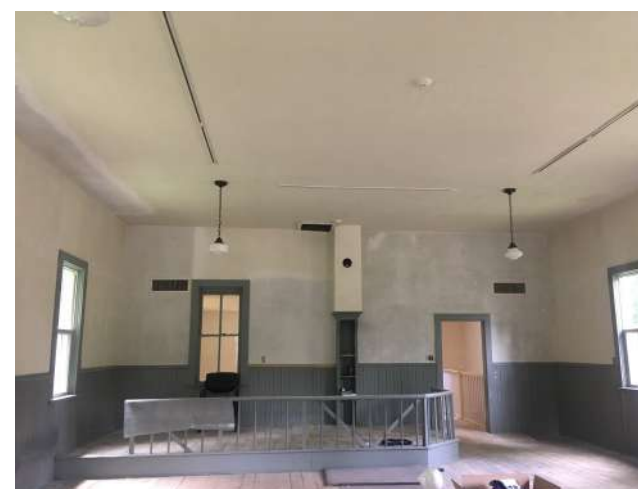
Main floor interior plaster repair in progress.