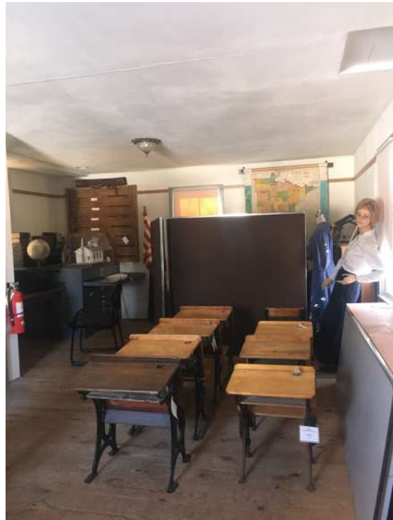
(Above and above right) Classroom addition previous to rehabilitation.