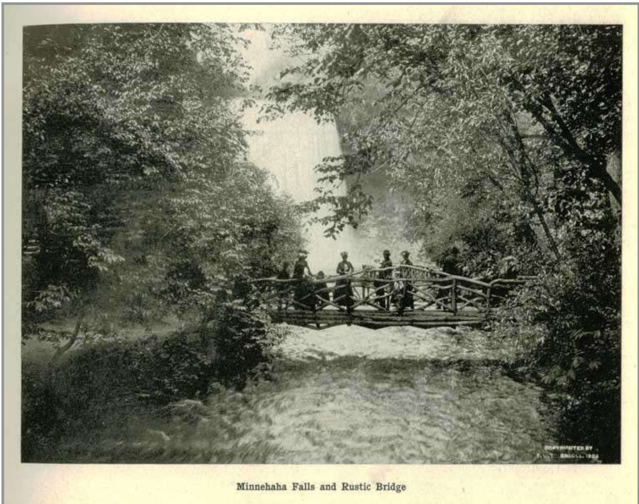
Minnehaha Falls and Rustic Bridge

Postcard of Minnehaha Falls featuring the "rustic bridge," c. 1895. http://www.cityhistory.us/minneapolis/metropolis.htm