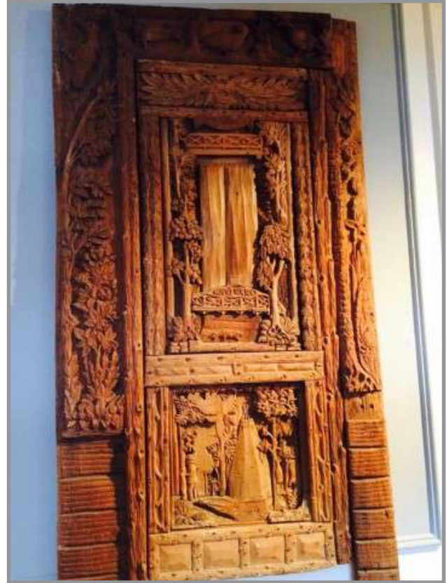
Installation view of "Our Hennepin County" at the Hennepin History Museum, 2015, featuring Peter Winnen's carvings. http://twincitiesblather.blogspot.com/2016/01/hhm-resident-kitty.html

With its shallow relief carvings, the Crystal Bay pulpit is stylistically more similar to the magazine rack. Peter used color instead of shadow to create contrast. The left panel features a sheaf of wheat crossed by a banner inscribed "My flesh is meat indeed." The right panel features carved fruit and leaves, with a banner that reads "My blood is drink indeed."