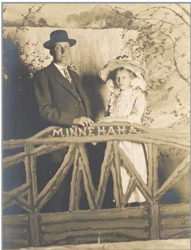
“Rustic bridge” prop in use at Kregel Photo Parlors, Minneapolis or St Paul, c. 1900.

Minnehaha Falls, made famous by Henry Wadsworth Longfellow’s epic poem of 1855, was represented in over 100 turn-of-the-century postcards. Tourists seeking a souvenir could visit certain local photographers and pose atop