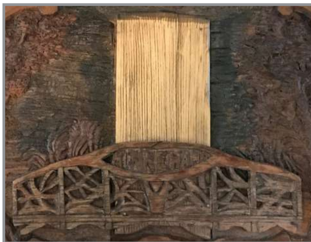
Peter Winnen, magazine rack, c. 1900, wood.

a painted version of Peter’s bridge, in front of a backdrop of the falls.