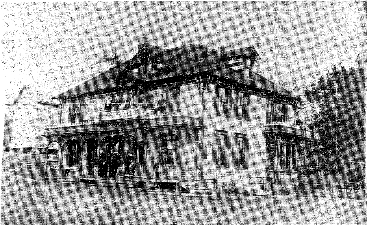
Farmer's Home Tavern - "Schiebe's Corner" 1892

(Was located on site of Metro Appliance Repair Building at County Road 15 and Old County Road 6)